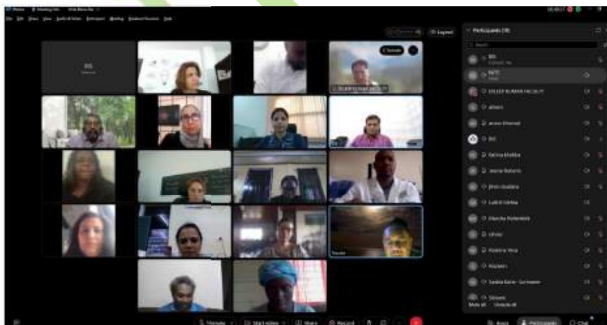
Online ITP on Laboratory Quality Management System